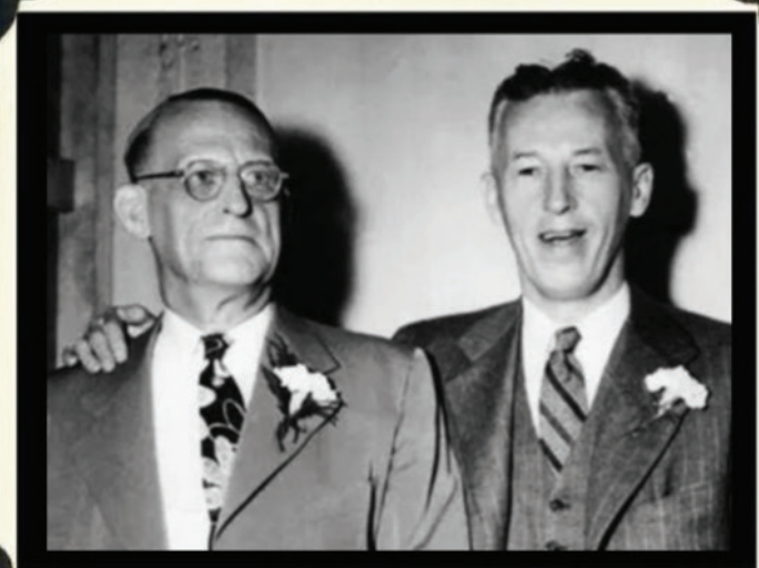
The two co-founders of Alcoholics Anonymous, Dr Bob, and Bill W. circa 1935